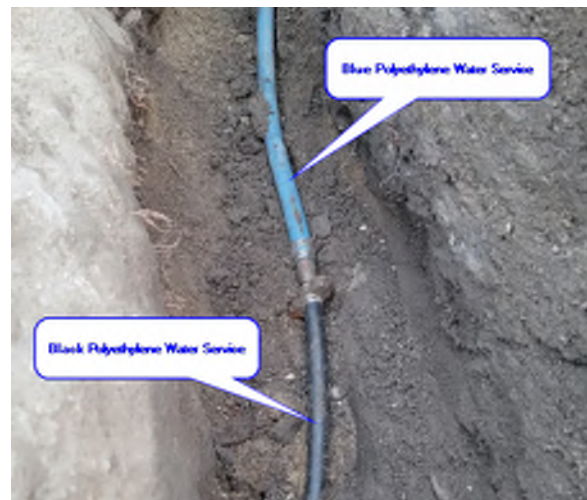
Black and Blue HDPE